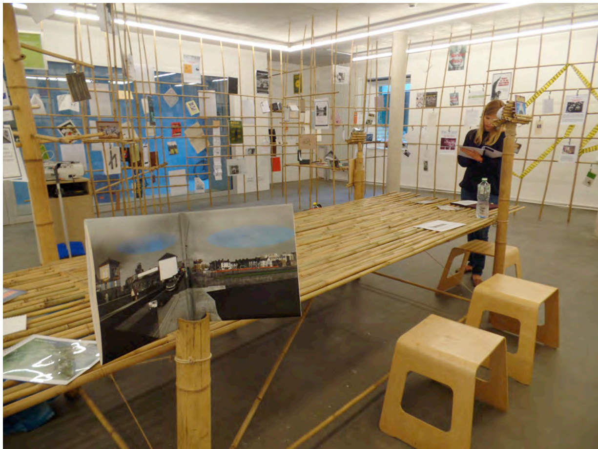
Zeppelin University, Friedrichshafen, Germany, Sept – Nov. 2015