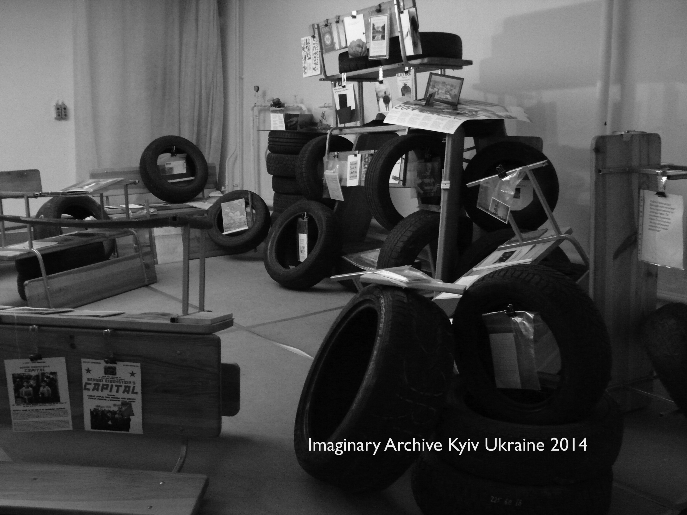
Imaginary Archive Kyiv Ukraine 2014