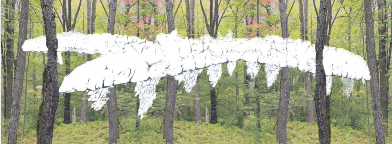
Gregory Sholette: mockup of proposal for Imaginary Archive at Socrates Park 2023