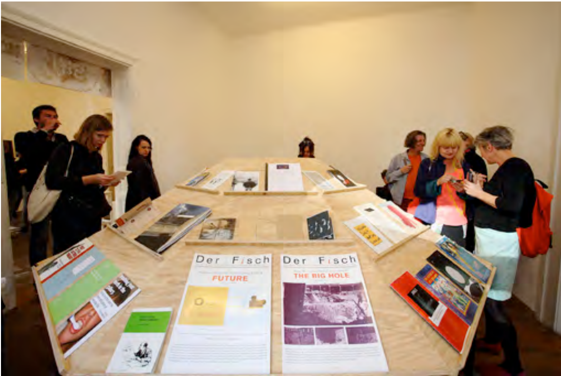
< rotor > Center for Contemporary Art, Graz, Austria, 2013