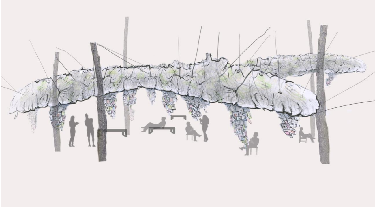
Stalactite structures holding curated content of Imaginary Archive @ Socrates Park