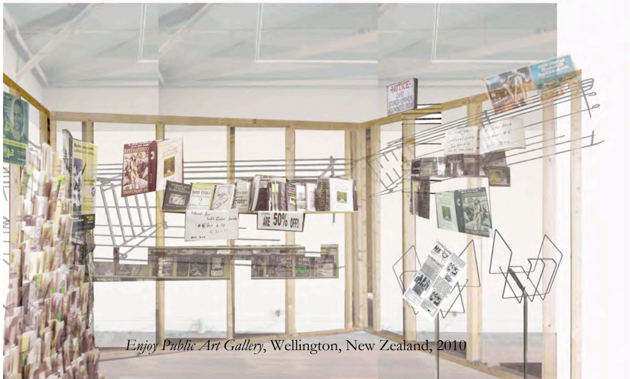
Enjoy Public Art Gallery, Wellington, New Zealand, 2010