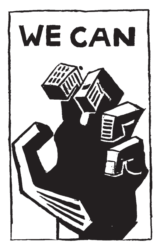
Figure 18 Seth Tobocman, WE CAN, linocut on paper, 1988 (Image S. Tobocman)

reworkings of topographical maps so that nations might be organized around shared resources and drainage basins, Fend was a sort of East Village version of the conceptual art team of Helen and Newton Harrison. But Fend's libertarian-like schemes fitted the entrepreneurial style of the 1980s more than the anti-commercialism of early 1970s conceptual art.