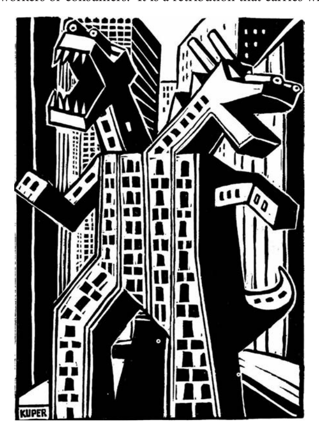
Figure 15 Gentrification, drawing on paper, © Peter Kuper, 1984

neighborhood in Liverpool, England. Following the analysis of Assemble, I present an evaluation of Theaster Gates and his work, including Dorchester Projects, the South Side Chicago art enterprise that is poised for replication in economically challenged cities around the globe. The chapter concludes with an appraisal of Conflict Kitchen in Pittsburgh, Pennsylvania, an art project that has morphed into a successful fast-food business in a city rated by the Movoto real estate brokerage firm as one of America's top ten most creative cities.<sup>27</sup> The link between creative industries, gentrification and upper-class indignation is not a simple one, and it has taken years to come into focus. Still, as early as 1984, Rosalyn Deutsch and Cara Gendel Ryan formulated an answer to a question not yet asked. The primary target of the affluent urban gentry is "directed against those who will never serve the interests of 'postindustrial' society, as either workers or consumers." It is a retribution that carries with it "the