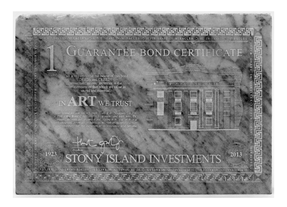
Figure 23 Theaster Gates, Bank Bond , limited edition artwork, 2013, marble, 6 1/8 \times 8 5/8 \times 13/16 in. (15.5 × 21.9 × 2.1 cm) © Theaster Gates.

In 2012 Gates purchased the abandoned Stony Island Savings & Loan bank building from the city of Chicago for $1, repurposing a portion of its marble interior, including material from the water closet, into a limited edition of 100 "Bank Bonds," or more accurately, "Art Bonds." Acid-etched into each sardonic collectable is the motto "In Art We Trust." (Some of the marble came from the bank's urinals, thus reinscribing the Duchampian readymade not only with acid but also a dose of Nietzschean ressentiment ?)<sup>19</sup> The following year at the Basel Art Fair in Switzerland Gates's White Cube gallery offered the satirical securities for $5,000 a piece: "I found myself with a failed bank, and here I was being invited to Basel, the land where banking never failed. So what did I do? I asked bankers to help me save my bank. That felt poetic."<sup>20</sup>