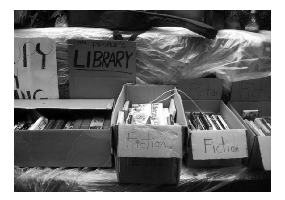
Figure 20 The People's Library, Occupy Wall Street (OWS), Zuccotti Park, NYC, October 1, 2011