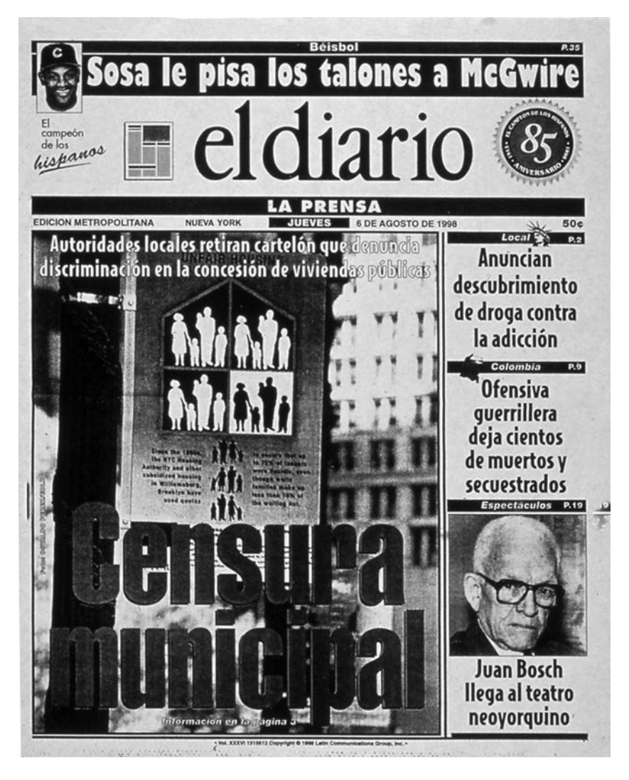
Figure 19 Cover of El Diario newspaper showing Marina Gutierrez's controversial REPOhistory street sign, which focused on a quota-system regulating public housing by race that favored white residents and was illegally removed from public display by local politicians, 1998