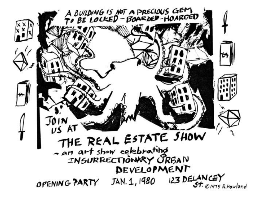
Figure 16 Becky Howland's photocopied flyer for The Real Estate Show, 1980 (Image B. Howland)

the late 1970s to the mid 1980s. What makes these artists' works cohere is that each uses natural iconography—nature as image or as idea—to critically respond to the entwined processes of real estate speculation and class displacement known as gentrification, while effectively treating the neighborhood itself as a thing brimming with "malignant city life."