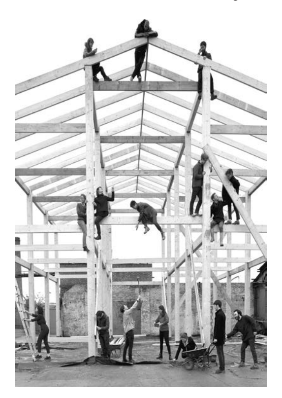
Figure 22 Assemble collective's Yardhouse studios for London creatives under construction

The practice of repurposing resources that already exist—versus innovating or engineering new ones—is an area of significant overlap between contemporary art and twenty-first-century capitalism. Low-risk and relatively low-cost, the process of creative reuse generates fantastic value-adding possibilities. Or so it seems. Where a defunded inner-city neighborhood previously lay in tatters, a rising spirit of self-repair and hope now emerges, and where once the overlooked working class was forced to