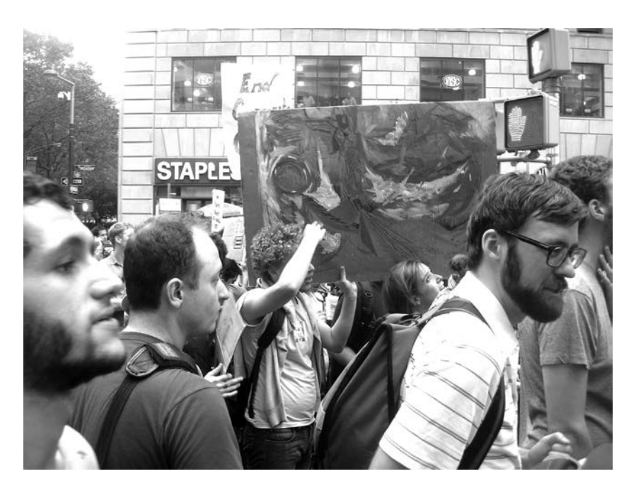
Figure 21 A painting on cardboard carried aloft up Broadway by OWS Zuccotti Park demonstrators, October 1, 2011