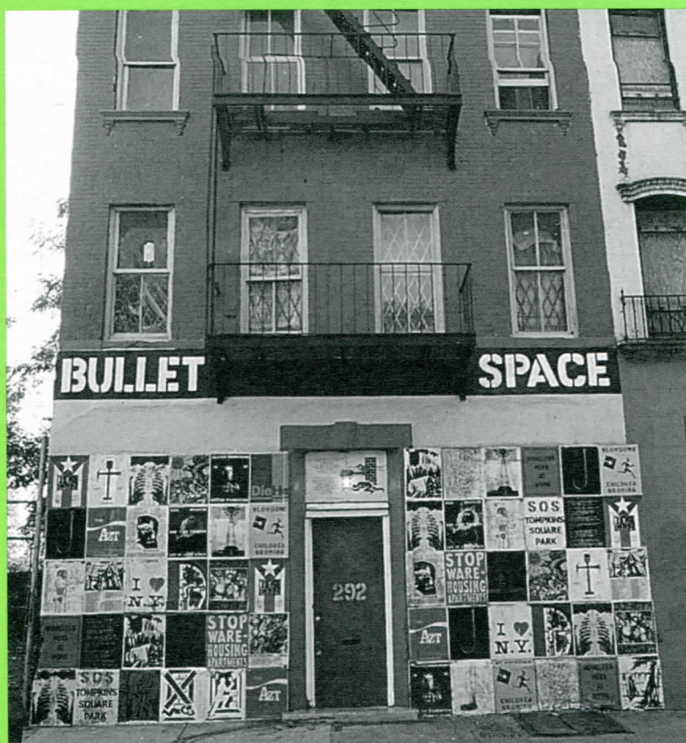
Bullet Space: Your House is Mine, 1988-92. Book & Street Project.