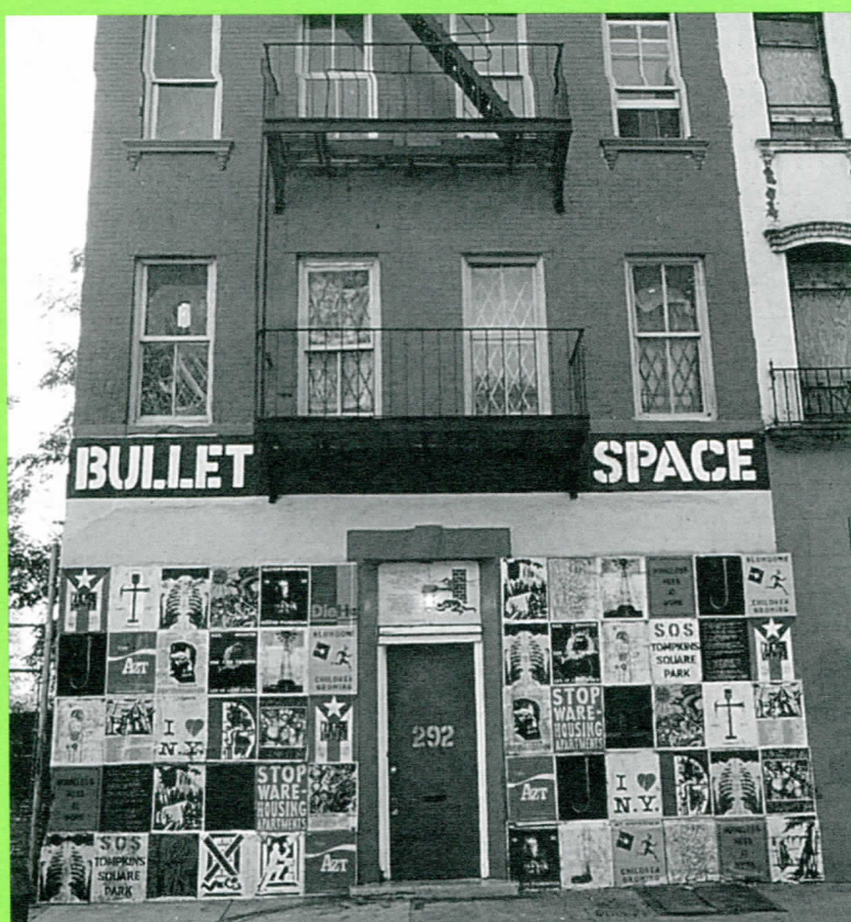
Bullet Space: Your House is Mine, 1988-92. Book & Street Project.