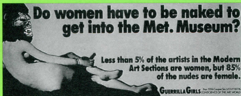
Guerrilla Girls: "Do Women Have to Be Naked to...", offset poster, 1990.