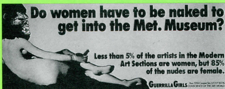
Guerrilla Girls: "Do Women Have to Be Naked to...", offset poster, 1990.