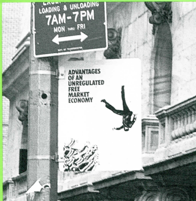
REPOhistory: "Advantages of a Free Market" by Jim Costanzo. Metal street sign in front of New York Stock Exchange, 1992.