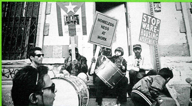
Gathering for Protest, East 13th Street.