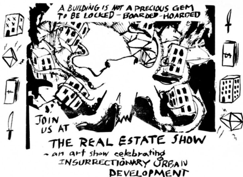
ABOVE ABC No Rio Dinero: flyer for the Real Estate Show; Rebecca Howland, artist, 1980.

COVER Political Art Documentation and Distribution's 1984 anti-gentrification street poster project Not For Sale on New York's Lower East Side.